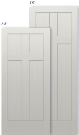
4 Panel 3/4