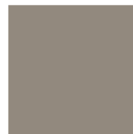
Slate Grey SKU008