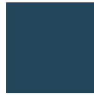
Deep Blue Sea SKU006