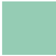
Sandstone Green SKU005