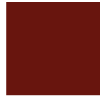
Scarlet Brick SKU009